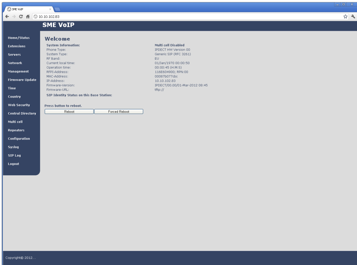
Figure 1. "Home" on the Web server